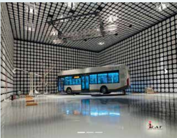
Electromagnetic Compatibility Lab