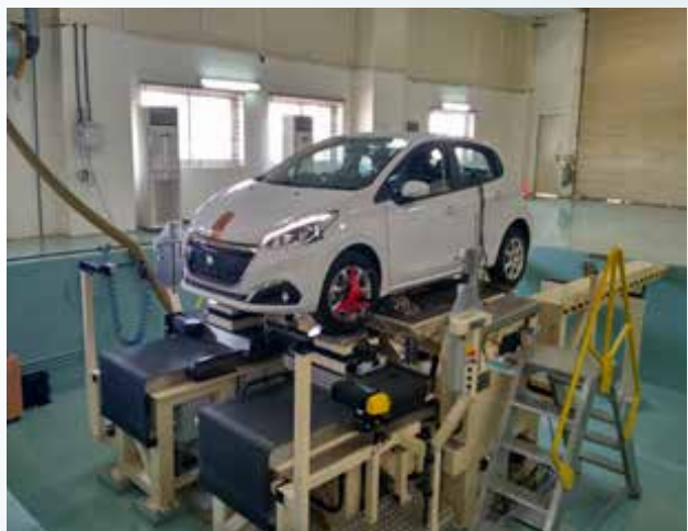
Vehicle Dynamics (VDY)