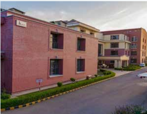
ICAT, Campus -1 Manesar