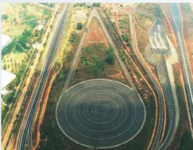
Steering Pad (Test Track)