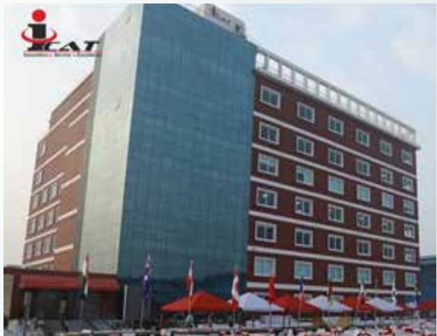
ICAT, Campus -2 Manesar