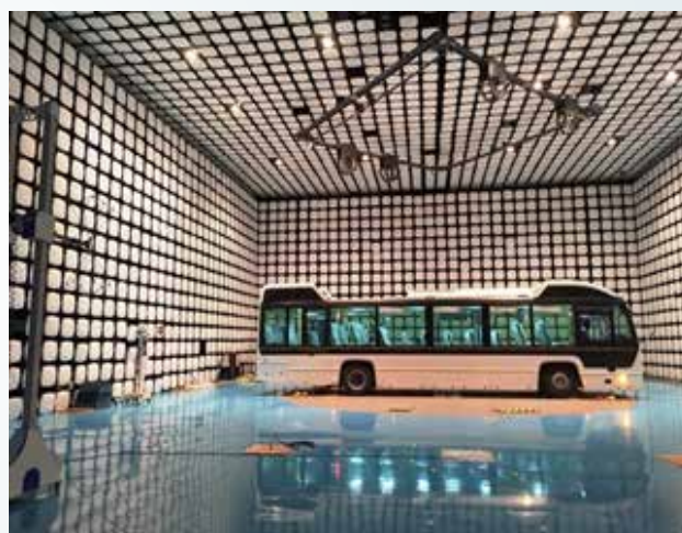
EMC/EMI Testing Lab