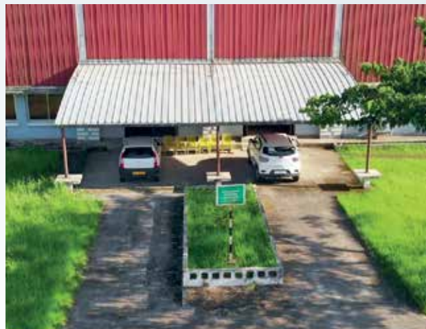
Mechanics Training Institute